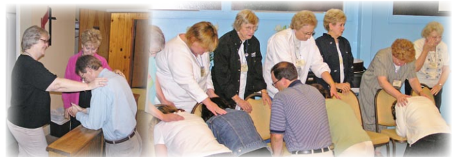
Prayer Team in Action

You can continue your Discover experience by attending every retreat. We have a Bible study, a prayer team or you can be a small group leader or help with the Worship team. The Prayer team under girds every aspect of the retreat with prayer. They also pray for concerns of individuals who have come to the retreat. The Serendipity Bible study group does a study on a different topic at each retreat. Participants also learn how to lead a Serendipity Bible study at home or in their church. There are plenty of opportunities for your Discover experience to continue on. Give it a try!