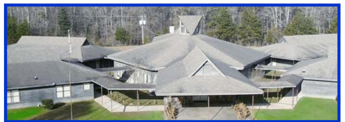
Wesley Pines Conference, Retreat, Camping Center Gallman, Mississippi

The deadline to register for the retreat is September 19 with the home study beginning on September 29. We have found the best publicity we have is the testimonies of those who have attended a retreat, so we want to encourage each of you to talk to your friends and put a brochure in their hands. One suggestion at the last retreat was to hand them a $10 bill with the brochure for the "hold my place" registration fee. Tell them it is theirs and they can use it however they please, but you are inviting them to come to the retreat. Plant a seed and see what God does with it!